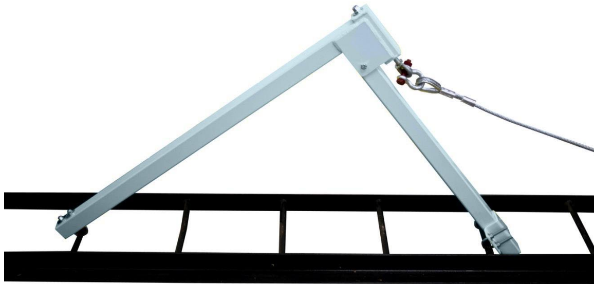
Curved Ladder Top Bracket Figure 3

The top bracket (Figure 3) should be positioned on the rungs to allow the user to safely connect and disconnect to the cable between uses. The bracket can be installed up to 12" (30.5 cm) off-center of the ladder if required. Place the U-bolt bracket near the base of the pivoting leg. Using U-bolts, fasten each leg (one on the stationary leg and two on the pivoting leg) onto the corresponding rung of the ladder and tighten the six nuts, ensuring that the legs are held securely in place. _