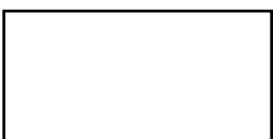
39/10100 SKY WHITE