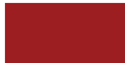
39/30100 FIRE ENGINE RED