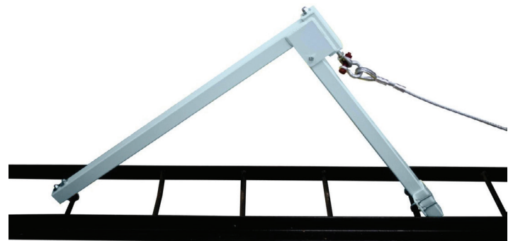
Curved Ladder Top Bracket - Figure 3

The top bracket (Figure 3) should be positioned on the rungs to allow the user to safely connect and disconnect to the cable between uses. The bracket can be installed up to 12" (30.5 cm) off-center of the ladder if required. Place the U-bolt bracket near the base of the pivoting leg. Using U-bolts, fasten each leg (one on the stationary leg and two on the pivoting leg) onto the corresponding rung of the ladder and tighten the six nuts, ensuring that the legs are held securely in place.